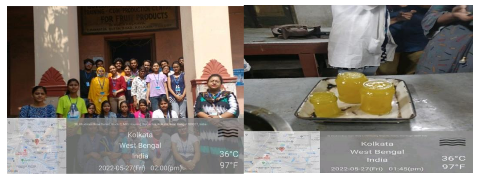
Field training on Food processing T& C North Kolkata, Govt. of West Bengal (COURSE CODE-FNTADSE04P)

3. A visit to Food Village, a multi cuisine restaurant was organized by department of Food and Nutrition of PCMM Collegeto fulfil the requirements Course Code FNTADSE04P under West Bengal State University for Food and Nutrition Honours -Semester VI Honours students on 8<sup>th</sup> July 2022. Total 27 students were present accompanied by 1 faculty member. This visit was very informative as all the staff members especially the manager of the food and beverage institution was very helpful. A questionnaire was prepared for collecting data on food and beverage management and the manager was asked about different aspects of their services. This visit will help them in opening new ventures as an entrepreneur in food and beverage services.