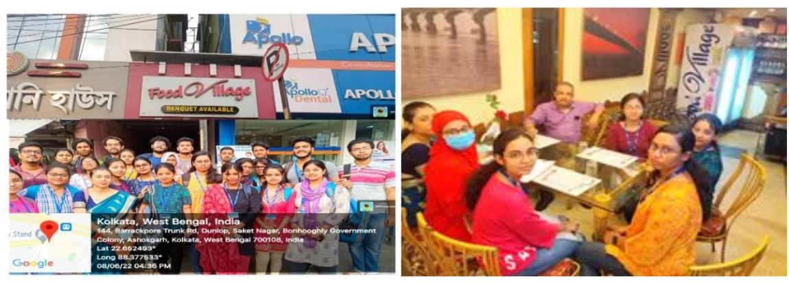
Visit to Food Village- a multi cuisine restaurant at Dunlop (COURSE CODE- FNTSSEC02M)

3. A visit to Food Village, a multi cuisine restaurant was organized by department of Food and Nutrition of PCMM Collegeto fulfil the requirements Course Code FNTADSE04P under West Bengal State University for Food and Nutrition Honours -Semester VI Honours students on 8<sup>th</sup> July 2022. Total 27 students were present accompanied by 1 faculty member. This visit was very informative as all the staff members especially the manager of the food and beverage institution was very helpful. A questionnaire was prepared for collecting data on food and beverage management and the manager was asked about different aspects of their services. This visit will help them in opening new ventures as an entrepreneur in food and beverage services.